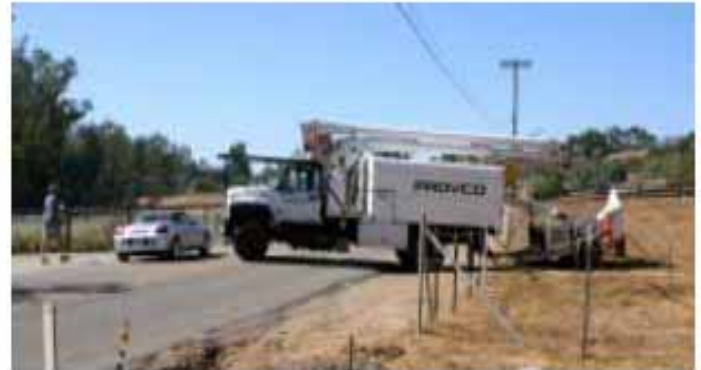
Local resident directs traffic around runaway PROVCO truck