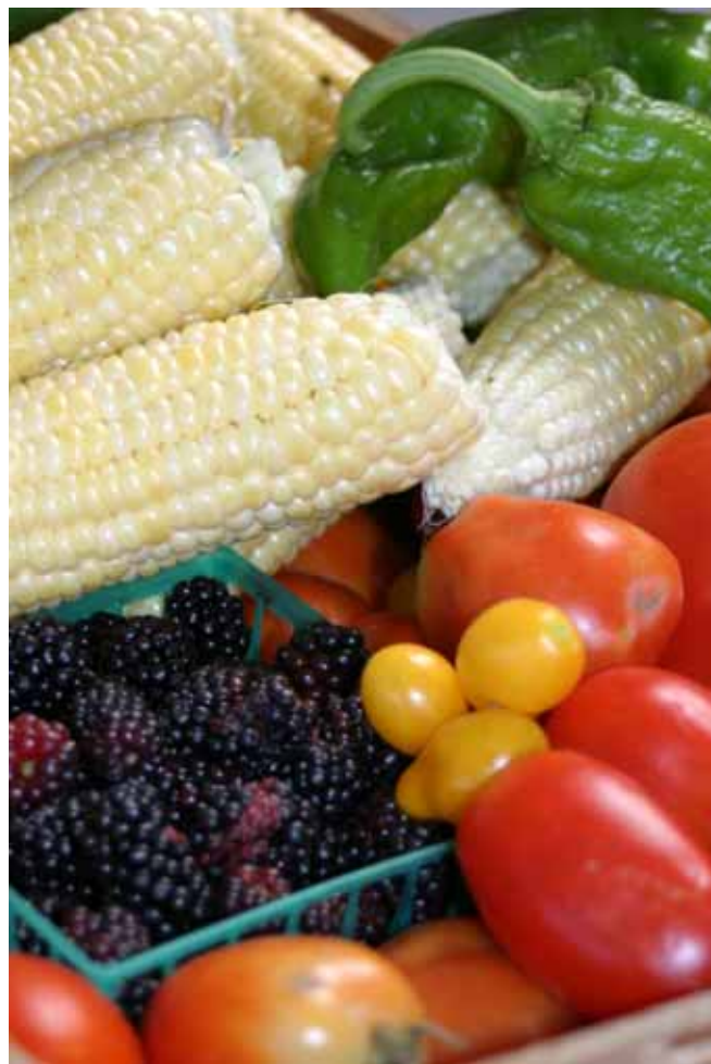
The garden's bounty of summer vegetables.