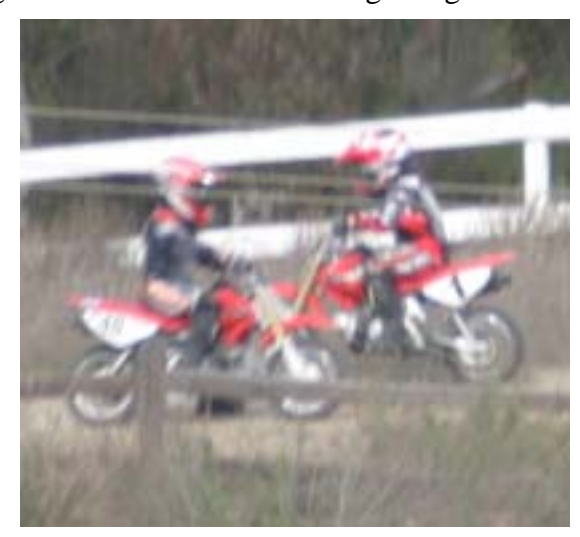
Off-road motorcyclists trespassing on the CWA easement

Motocross - These off-road motorcycle riders are not just a public nuisance with the noise and dust they make. They frequently created a public safety hazard and liability by trespassing via the horse trails, private roads, County Water Authority and OMWD easements, and even through the chaparral. The riders ignore posted "no trespassing" and "no motorized vehicle" warnings. Their presence invites other illegal riders who see them racing along the roads.