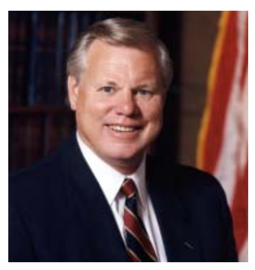
San Diego County Fifth District Supervisor Bill Horn

San Diego County Fifth District Supervisor Bill Horn has offered Elfin Forest a grant of up to $15,000 in matching funds for whatever monies we raise with the Elfin Forest Garden Festival. Who knew that Supervisor Horn could be a garden angel and friend of the trails? The proceeds from this year's garden festival (see related article) will go toward the beautification of the trail created when gates are installed at both ends of the unpaved portion of Ouesthaven Road. The existing battered chain link fence will be removed and replaced with split rail fence with the goal of creating a safe and scenic place to walk and ride. Many thanks to Supervisor Horn and his staff. Now you can do your part, and order your garden festival tickets! An order form is on the back of the cover page, or you can order tickets online at www.elfinforestgardens.info.