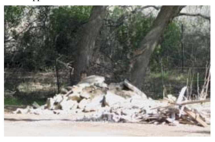
Illegal dumping on Questhaven Road

Illegal Dumping - At the beginning of February, someone dumped this load of concrete and construction materials on the unpaved portion of Questhaven Road. Within a few days, another load was dropped next to it.