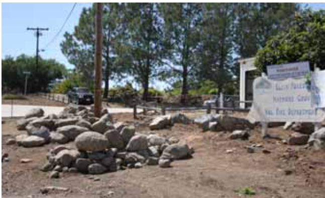
Landscaping in progress at the fire station