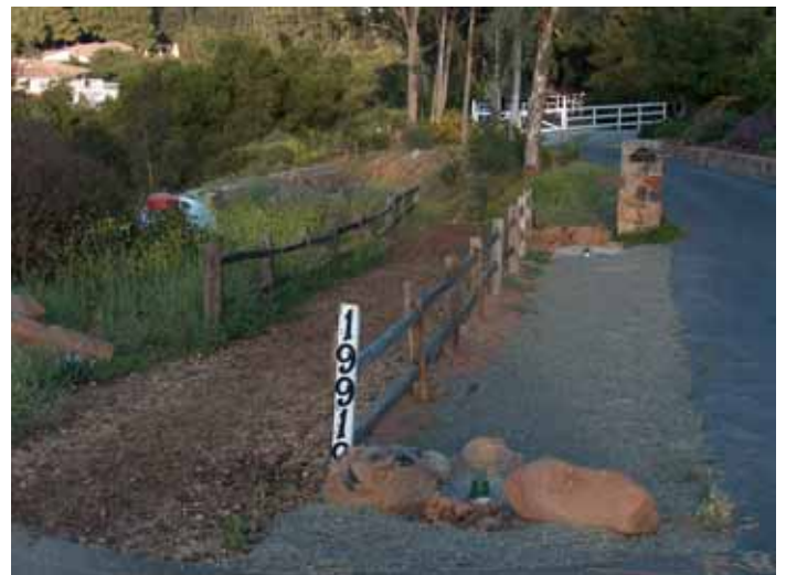
Nick Jakawich and Troop 2000's Eagle Scout project

(Ed note: Elfin Forest will soon have a new trail created from the unpaved portion of Questhaven Rd. It has been closed since last year, and gates are now being constructed, so please remember to use an alternate route. Only emergency vehicles are permitted on that section of the road.)