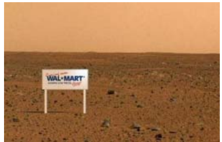
Wal-Mart opening soon on Mars. Resistance is futile(?)

A chaparral reader forwarded this amazing image claimed to be from NASA's Spirit rover currently touring the surface of Mars. It appears that even an average temperature of 76 degrees below zero Fahrenheit wasn't enough to discourage Wal-Mart's expansion in our solar system.