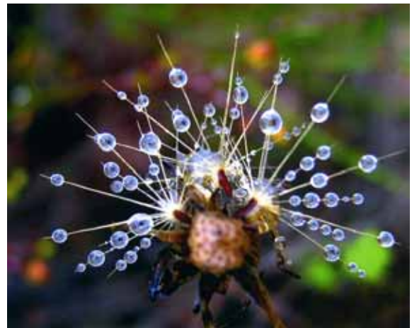
Dewey Dandelion