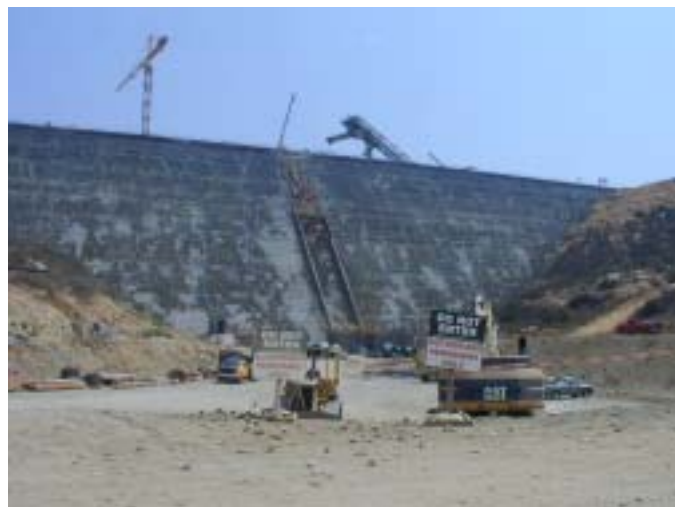
View of the reservoir dam from the pumping station.