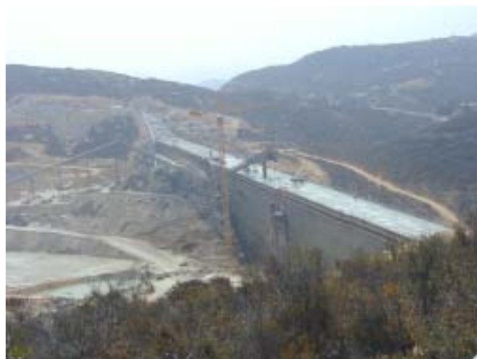
View of the reservoir dam toward the south.

The immensity of the project will be obscured when the reservoir is filled with water so now is the time to check it out. Tours are available on a first-come first-served basis on Thursdays, Fridays and one Saturday a month. Call the project information line at 877-426-2010 to make tour arrangements.