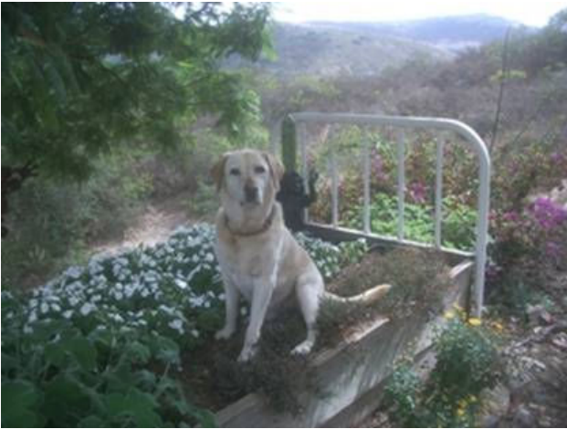
Becca, the best dog a girl could have, rest in peace until we meet again,