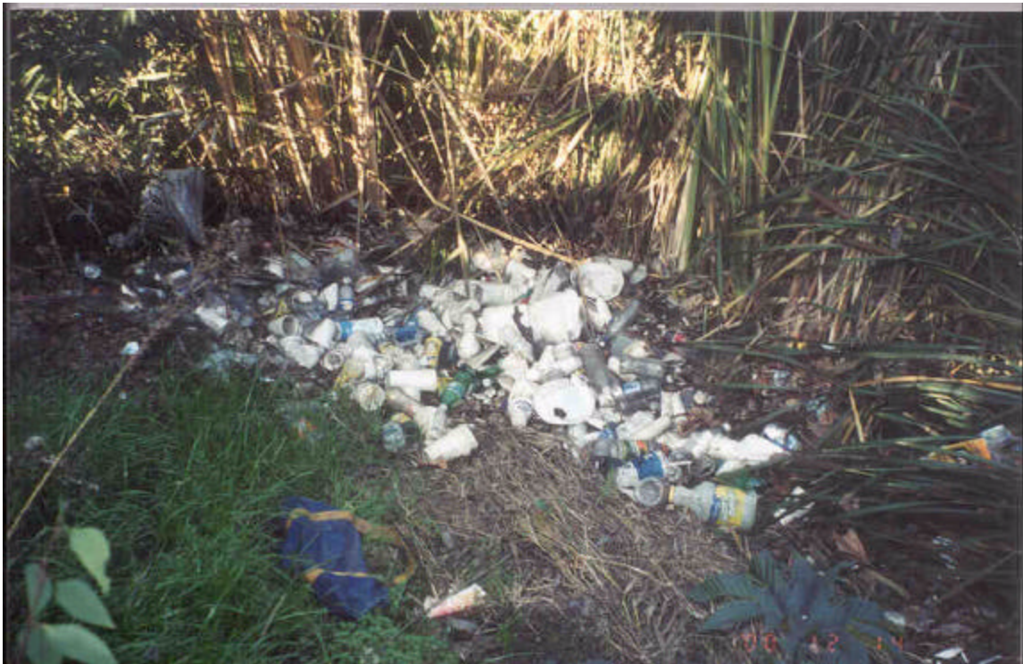
Trash - illegally dumped along the creek.